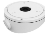
DS-1281ZJ-S Inclined Base Mounting Bracket